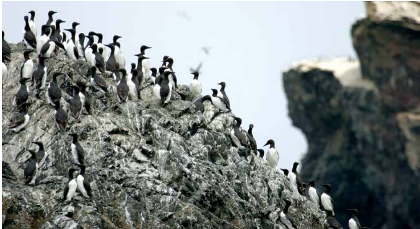
Common Murre colony